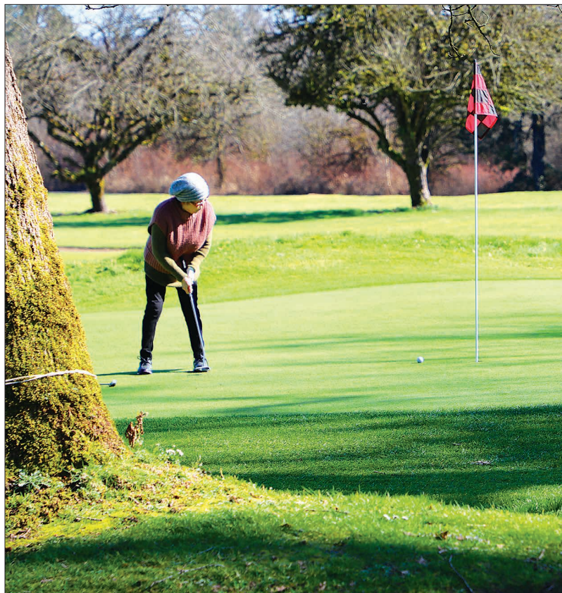
Spend a memorable time on the greens during CTLF's annual Golf Tournament Fundraiser at Oaksridge Golf Course.

This year, the highly anticipated Win a Harley for a Hole-In-One is making a comeback! Participants also have the chance to win prizes for Longest Drive, Closest to the