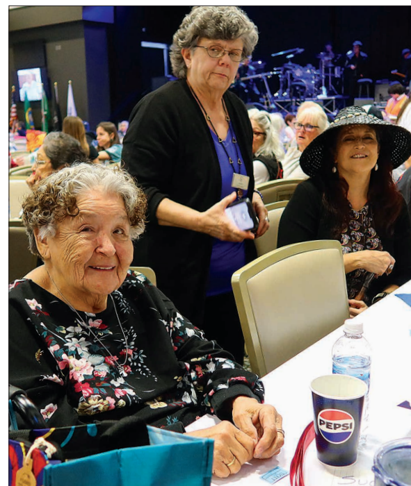
Delicious salmon was prepared for the luncheon, intricate handmade jewelry was available for purchase and the three-piece band Elvis Unplugged offered an exciting assortment of songs for those in attendance, among other highlights.