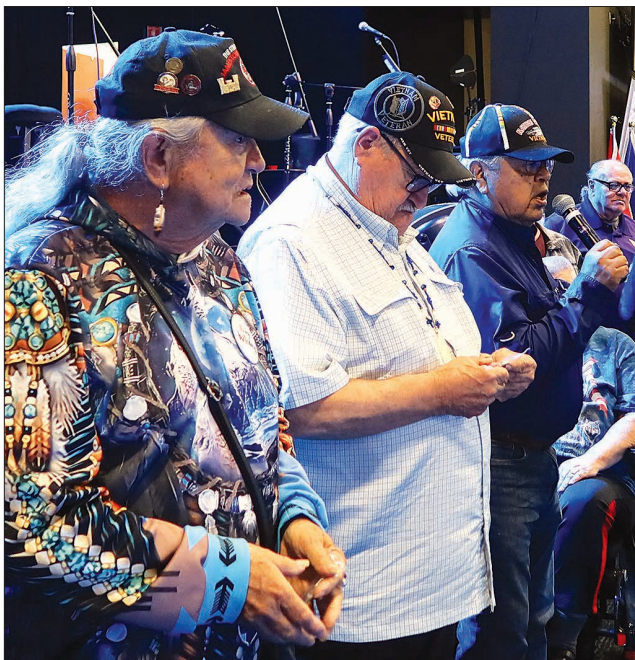
The annual Elders Luncheon honored proud veterans and gave participants the opportunity to greet the Tacoma Rainiers mascot Rhubarb and visit with members from many other tribes.