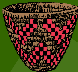
Tsapowum- "becoming strong"